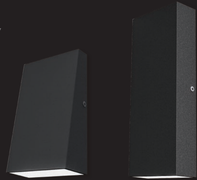
INDUX Wall Light